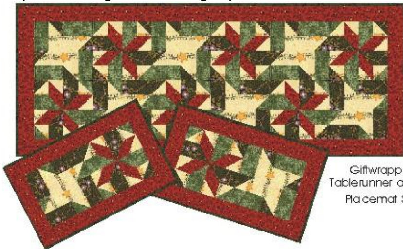
Giftwrapped Tablerunner and Placemat Set

Step 12: Sew together according to picture.