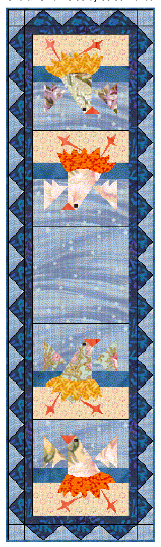
Unnamed Overall Size: 18.50 by 66.50 inches